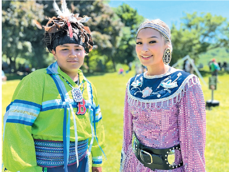
Artpark Strawberry Moon Festival file photos.